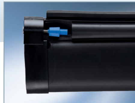
Principle of the crimp connection of the Optima-Plus connectors

The evaluation electronics monitor the safety strip, which is equipped with a terminating resistor and operates using the closed circuit principle. An amount of current defined by the resistance (8.2 kΩ) flows through the safety strip. When mechanical pressure causes the resistance in the safety strip to drop below 5.5 kΩ, this is recognised as an actuation (evaluation electronics: LED RED). When contact resistance or a broken cable raises the resistance in the safety strip above 11.5 kΩ, this condition is recognised as a broken cable and/or fault (evaluation electronics: LED YELLOW). In both cases, the system stops (evaluation electronics: safety relays K1 and K2 open).