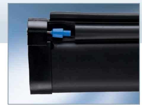
Principle of the crimp connection of the Optima-Plus connectors

The evaluation electronics monitor the safety strip, which is equipped with a terminating resistor and operates using the closed circuit principle. An amount of current defined by the resistance (8.2 k \Omega ) flows through the safety strip. When mechanical pressure causes the resistance in the safety strip to drop below 5.5 k \Omega , this is recognised as an actuation (evaluation electronics: LED RED). When contact resistance or a broken cable raises the resistance in the safety strip above 11.5 k \Omega , this condition is recognised as a broken cable and/or fault (evaluation electronics: LED YELLOW). In both cases, the system stops (evaluation electronics: safety relays K1 and K2 open).